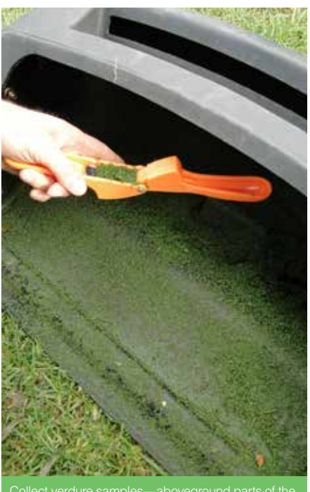
collect verdure samples—aboveground parts of the urf plant remaining after clippings removed. A golfall sized, compressed verdure sample is usually ufficient to produce adequate sap for the test.